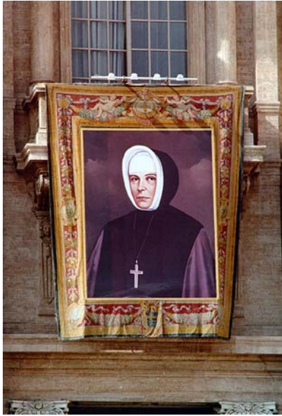
Image of Blessed Emilie Gamelin in the glory of Bernini* exposed on the facade of St. Peter's Basilica in Rome during the Beatification ceremony.

At the beginning of 2011, and in light of these anniversaries, we wish to express our sincere greetings to all our readers. May each of you benefit from the abundant favors Providence deigns to give to those who hold in their hearts the "Great lady of Montreal", Blessed Emilie Tavernier-Gamelin.